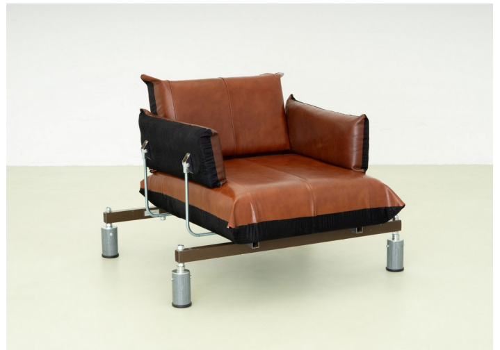
Arnaud Eubelen As Long As The Body Follows, 2025

Found materials 90 x 90 x 70 cm [HxWxD] (35 \frac{7}{16} " x 35 \frac{7}{16} " x 27 \frac{9}{16} " )