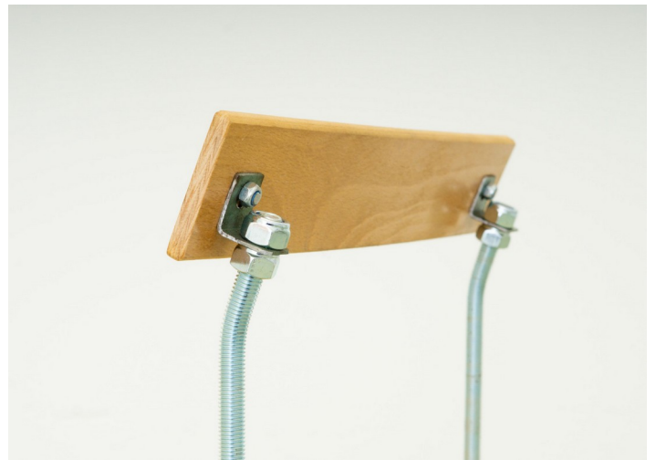
Arnaud Eubelen Agglomerate (D), 2025

Found materials 80 x 45 x 40 cm [HxWxD] (31 1/2" x 17 23/32" x 15 3/4") Edition 1 of Unlimited