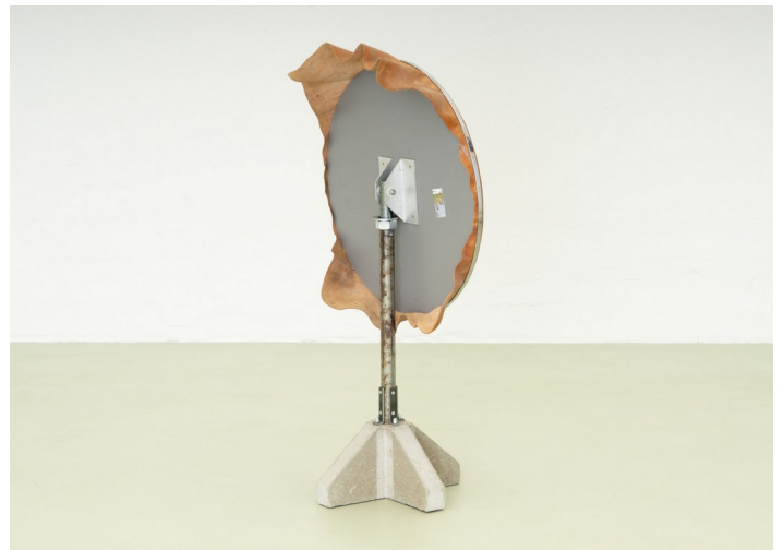
Arnaud Eubelen Sticky Table, 2025

Found materials 50 x 50 x 72 cm [HxWxD] (19 \frac{11}{16} " x 19 \frac{11}{16} " x 28 \frac{11}{32} " )