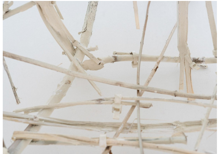
Grace Prince Work in progress, 2025 –