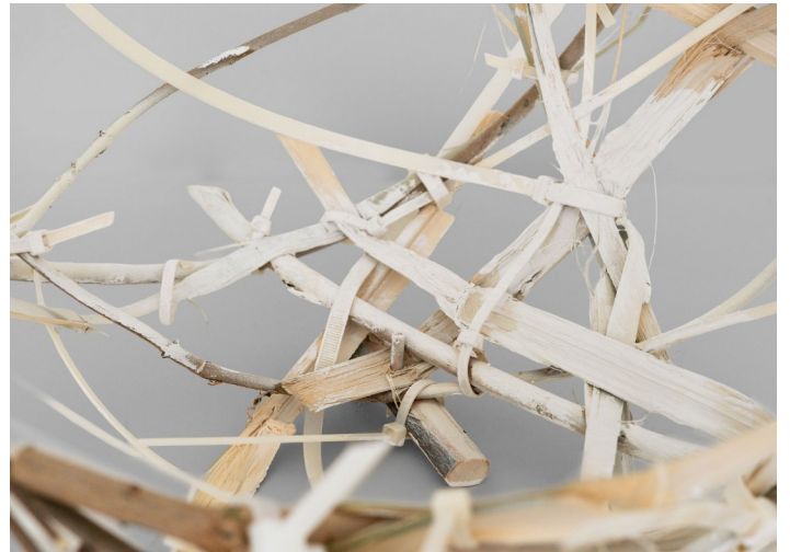
Grace Prince Untitled, 2025

Bamboo, Wood, paint, plastic 44 x 40 x 40 cm [HxWxD] (17 5 / 16 " x 15 3 / 4 " x 15 3 / 4 " )