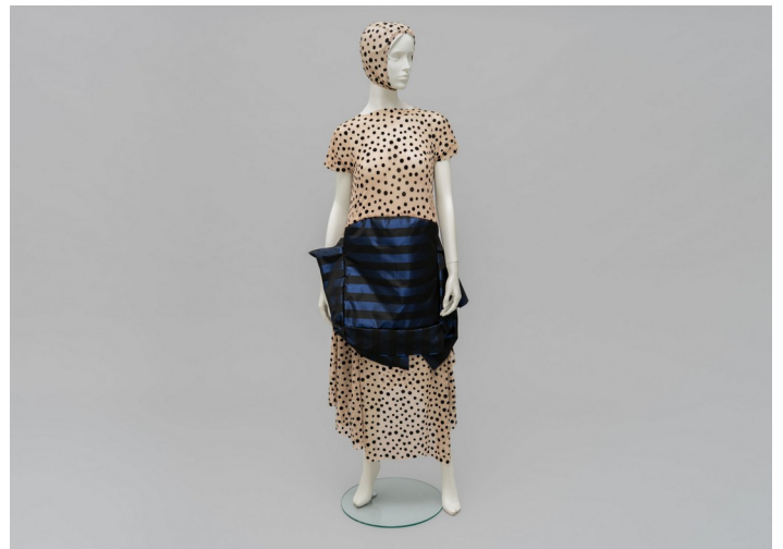
HULFE Dalmatian Fauteuil Dress, 2025

Flocked mesh, taffeta, polyester wadding Variable dimensions