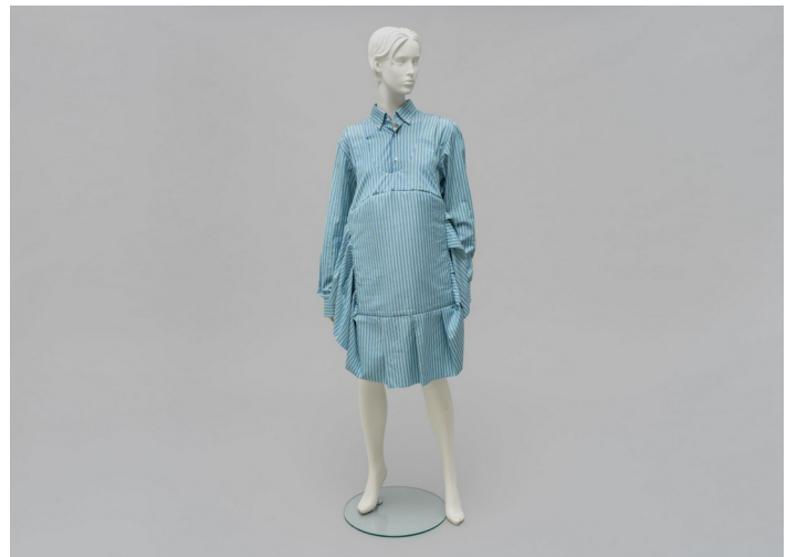
HULFE Schoolboy Malachite Dress, 2025

Cotton, tailored cotton mens shirt, polyester wadding Variable dimensions