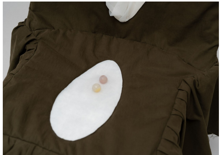
HULFE Frog Eye Pleasure Chair, 2025

Cotton, organza, wadding, gem stones Variable dimensions