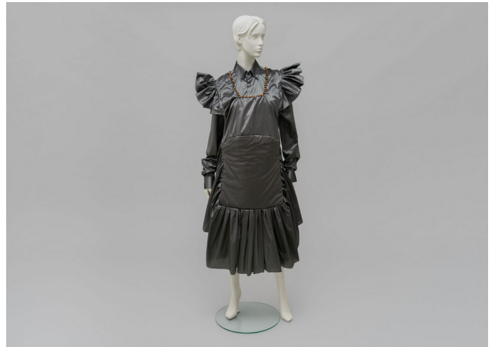
HULFE Mad Maid Onyx Dress, 2025

Taffeta, polyester wadding, tigers eye Variable dimensions