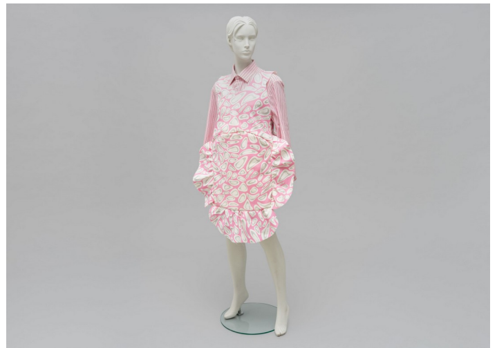
HULFE Space Diner Dress, 2025

Tailored cotton mens shirt, printed jersey canvas, moon stone, polyester wadding Variable dimensions