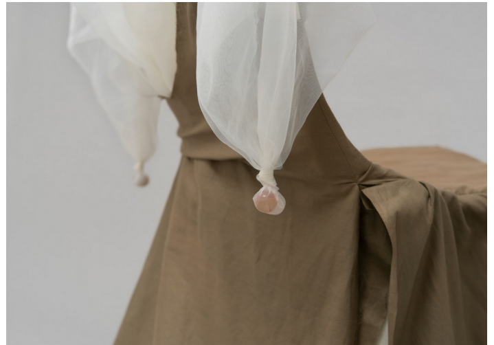
HULFE Frog Eye Dress, 2025

Cotton, organza, gem stone Variable dimensions